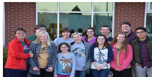
Salem Lutheran Youth Group takes a minute Smile at the camera before serving a meal.

Your thoughtfulness is greatly appreciated!