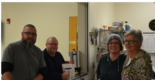
The Breakfast Gang is getting ready to serve hungry and appreciative residents.